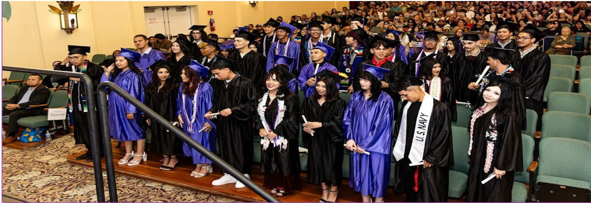
EOC CHARTER HIGH SCHOOL CLASS 2025