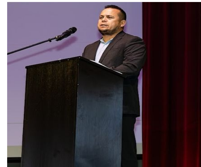
EOC CHARTER HIGH SCHOOL CLASS 2025