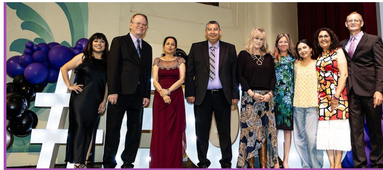
EOC CHARTER HIGH SCHOOL CLASS 2025