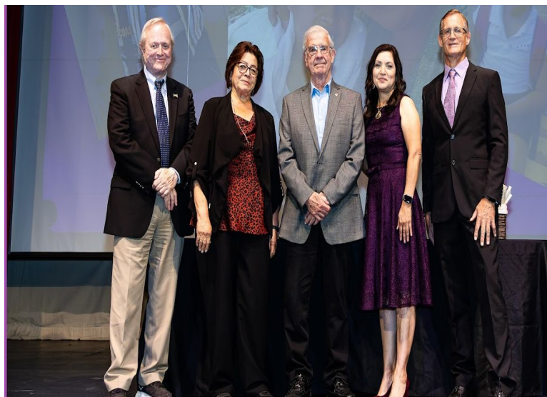
EOC CHARTER HIGH SCHOOL CLASS 2025